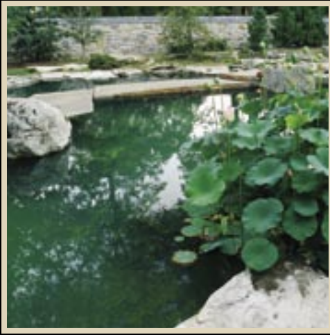
Residential Koi pond, Greenwich CT