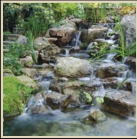
Cascading falls and water garden, Belair CA