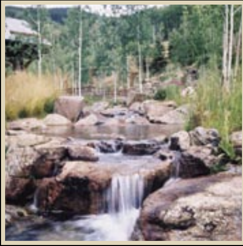
Natural-like streams and waterfalls, TYL Ranch, Silverthorne CO