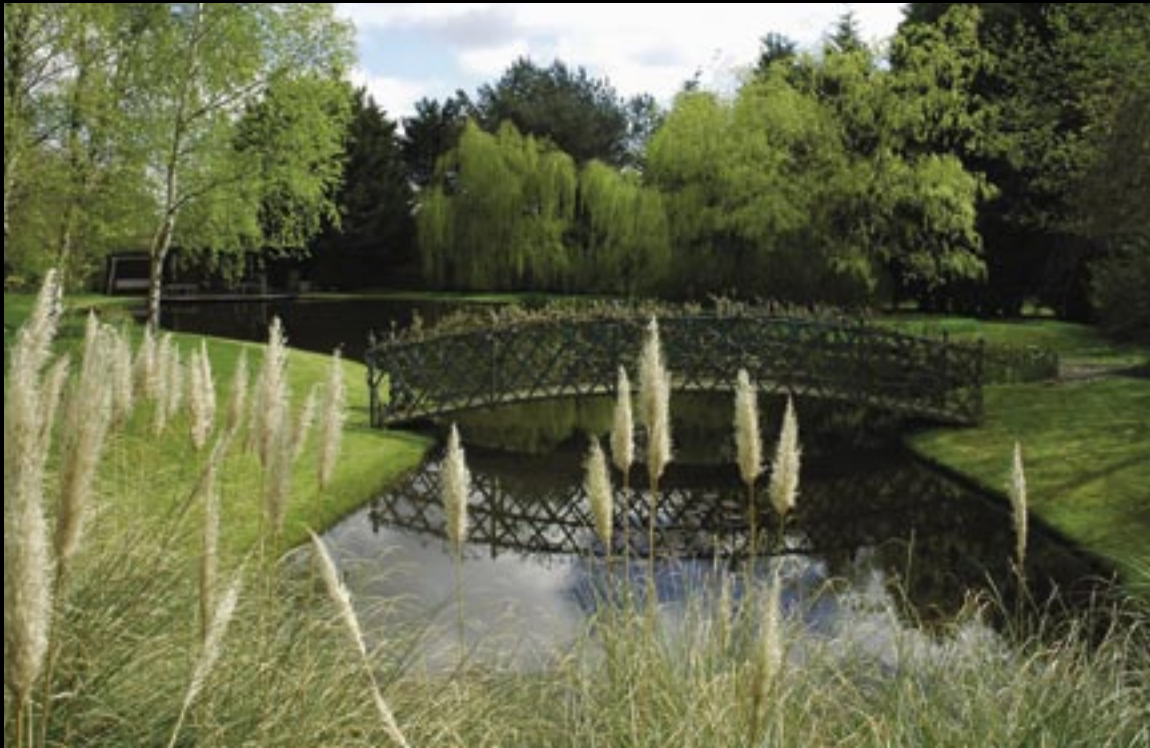
Lord Young Estate, England

WATER FEATURES CAN BE PROBLEM-FREE AND EASY TO MAINTAIN IF THEY ARE PROPERLY DESIGNED.